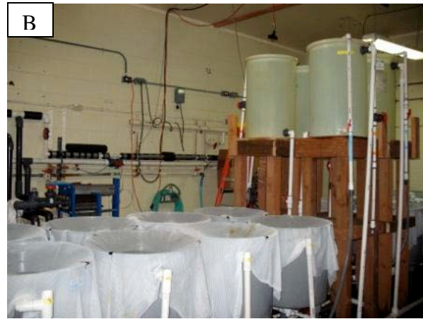
Figure 2 - Photos of lab setup. A) CO 2 control system B) Pollock tanks

Because Pollock spawning does not occur until mid to late December the first experiment is currently underway on juvenile (age 1+) fish. Do to size constraints three fish were placed in each tank (12 total fish for each pH treatment) and are currently being allowed to acclimate to the tank conditions. On November 1 st , 2009 pH treatments will begin on these fish and they will remain in the treated environment for six weeks. At the end of this time, the fish will be harvested and dissected for physiological analysis.